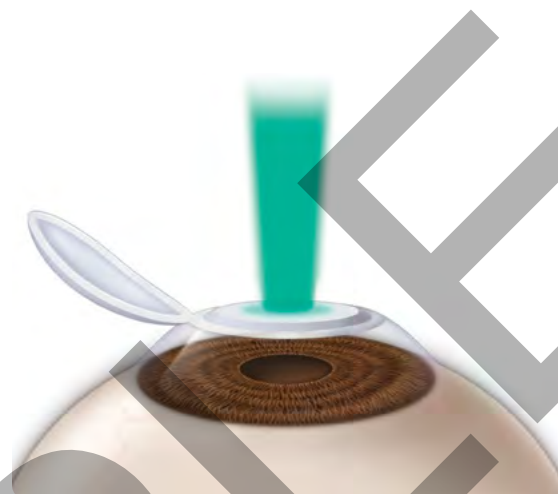
After a flap is created in the cornea, the laser sculpts the tissue.