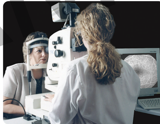
A patient having fluorescein angiography.

The American Academy of Ophthalmology is the world's largest association of eye physicians and surgeons. A global community of 32,000 medical doctors, we protect sight and empower lives by setting the standards for ophthalmic education and advocating for our patients and the public. For more information, visit www.aao.org .