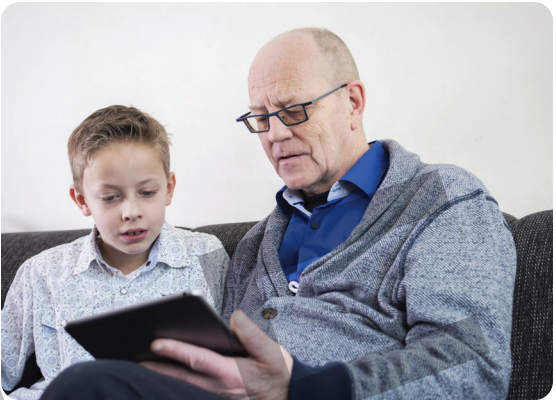
With today's tablet computers, you can change word size and adjust lighting.

tremor or arthritis. Some stand magnifiers have built-in lights.