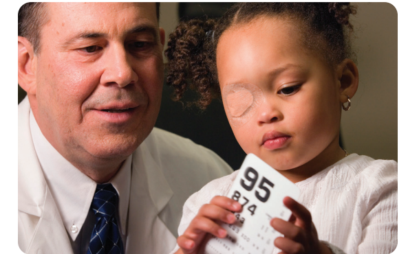
A common way to treat amblyopia is to have the child wear a patch over their stronger eye. This forces the child to use their weaker eye, which makes it stronger.

It can take several weeks to several months for vision to get stronger in the weaker eye. Once the child has better vision in that eye, he or she may need to wear an eye patch part-time for a few years. This helps keep their vision strong.